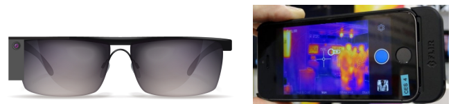
Figure 1: Examples of how thermal cameras are becoming more portable, discrete and usable in everyday scenarios Left: Illustration of possible future wearable thermal camera, based on current research prototype [10]. Right: Thermal camera smartphone add-on [13].

in the wild [10]. Consumers can purchase a thermal camera for only $150 to discretely augment their smartphones, and researchers have successfully integrated thermal cameras into wearable glasses and displays [2, 3, 10] (see Figure 1). This raises security concerns, however, as thermal cameras have been shown capable of enabling thermal attacks [1, 8, 9, 16]. This category of effective side-channel attacks functions by capturing a thermal image of a keyboard, keypad or touchscreen following user authentication, which then reveals heat traces that indicate the keys or areas pressed, and in what order, allowing deduction of the user's password or pattern. A near future where thermal cameras can be discretely worn and used therefore poses new security risks for commonly used interfaces, like ATMs, keyboards and smartphones; risks which designers must understand and be prepared to account for.